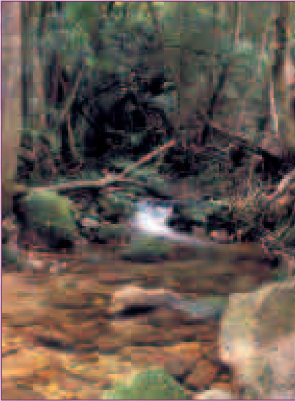
Mountain stream on Hainan Island, China.