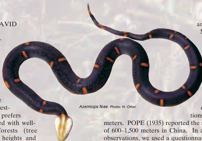
Azemiops feae.