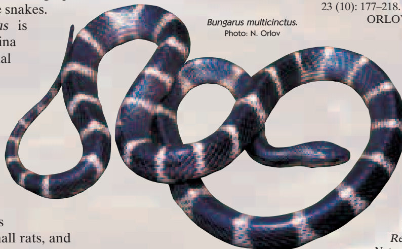
Bungarus multicinctus .

about 15 grams, and already contain developed embryos at the time of laying. The female guards and incubates the eggs. Newly hatched young measure 21.5–24 centimeters in total length. The female abandons her young about 24–30 days after they hatch. The young snakes eat mostly frogs, but shift to mice as they grow. ■