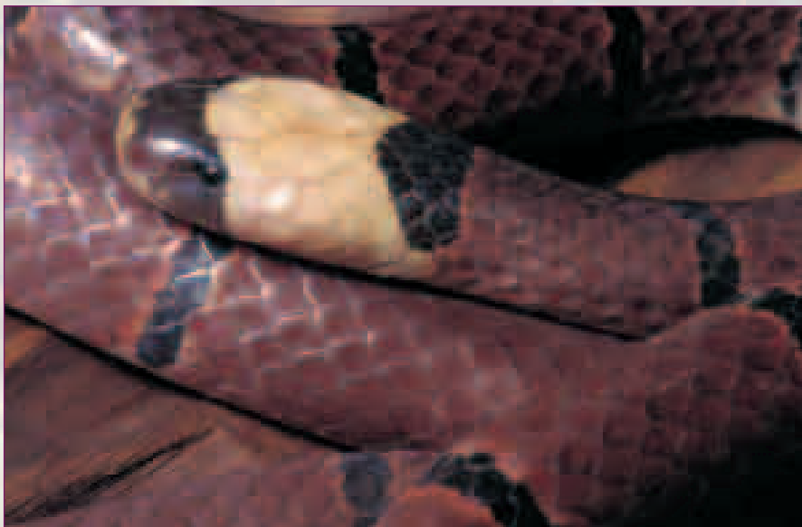
Hemibungarus macclellandi .

In cooperation with Chinese scientists, we were able to study the herpetofauna of southern China, with a special focus on the venomous snakes. More than 30 species of terrestrial venomous snakes of the families Elapidae and Viperidae are found in China (ZHAO and ADLER, 1993; ZHAO et al., 1998; ZHAO et al., 2000), and most of them (except the genera Gloydius , Vipera , and Ermia ) are found in southern China.