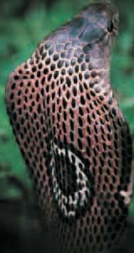
Naja atra .