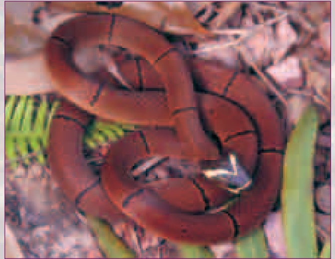
Hemibungarus kelloggi .

Naja atra occurs in a wide variety of habitats, from rice paddies in maritime lowlands to various types of mountain forests. It can live at elevations of more than 2,000 meters above sea level. It avoids dark forest with closed canopy. In primary monsoon and rain forests Naja atra inhabits clearings and riverbanks. Higher population density is