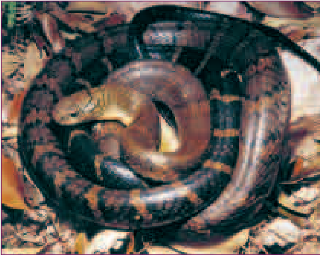
Ophiophagus hannah basking.

We saw gravid females from the middle of May to the middle of July. Clutches consist of 3–12 eggs.