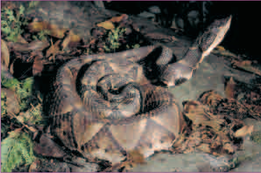
Deinagkistrodon acutus in the forest.

Lao Cai Province) it has been seen feeding on bamboo rats (genus Rhizomys ). Local people indicate that the adult snakes live in association with bamboo rat colonies, using the rat tunnels for shelter and ambush. Snake hunters visit these colonies at the proper time, and locate snakes by listening for the peeping sound emitted by rats being attacked in their underground nest chambers. The hunters then dig up the tunnels and catch the snakes.