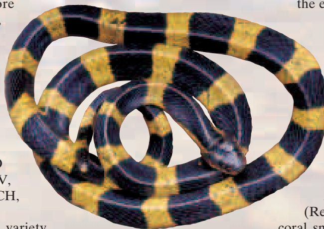
Bungarus fasciatus .

Mating and egg-laying periods are very extended. We observed cobras mating in the mountains of the western Tonkin region, at elevations of 400–2,000 meters, in March through May; gravid females with 6–23 eggs were recorded from May to the end of July.