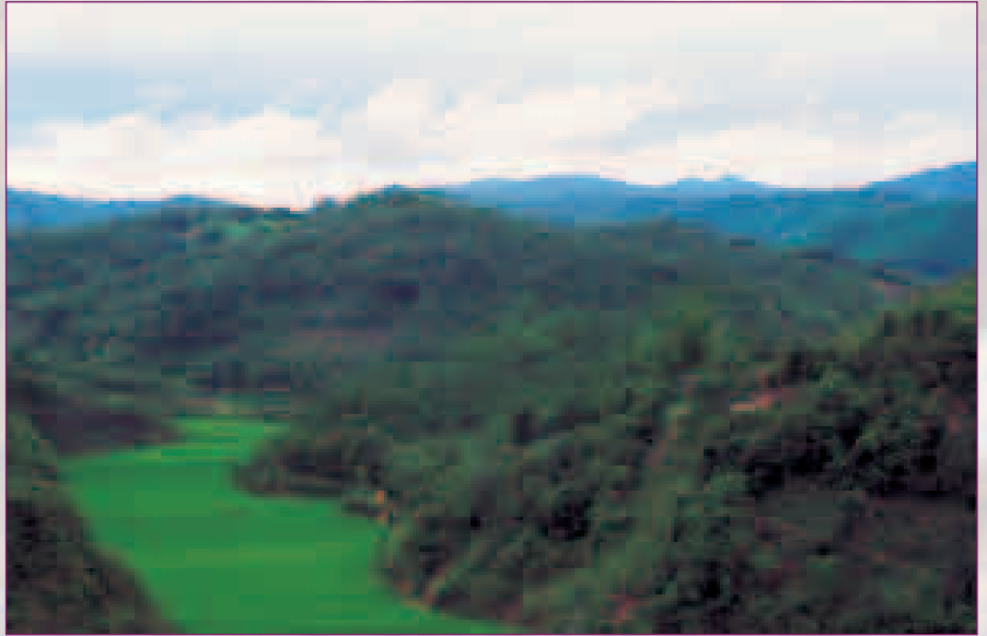
Mountainous terrain in southern Yunnan, China.