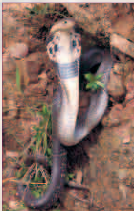
Naja atra.